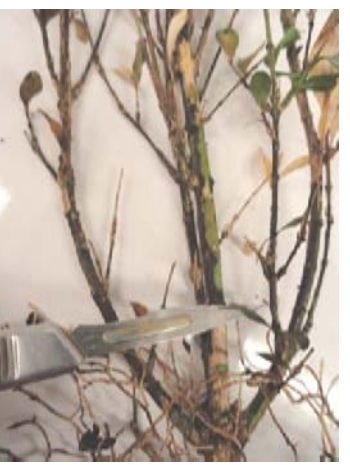
Figure 2: Dark stripes of cankers caused by C. buxicola .