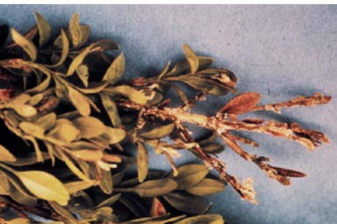
Figure 6: Symptoms of Volutella blight caused by Volutella buxi on boxwood. Note spore masses on stem.