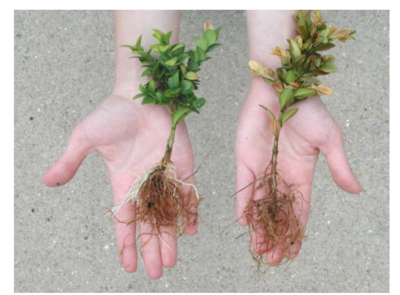
Figure 8: Browning of boxwood roots and foliage caused by Phytophthora root rot