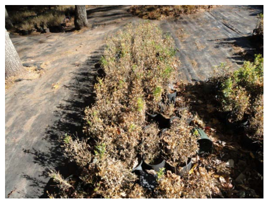
Figure 1: Defoliated boxwood crop, caused by C. buxicola .