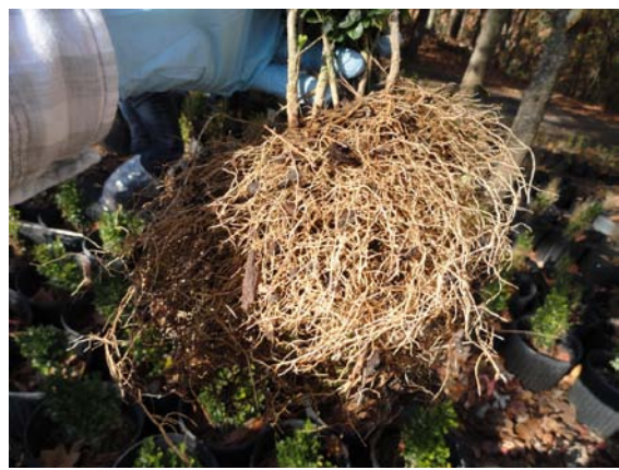
Figure 5: Healthy root system of boxwood infected with C. buxicola .