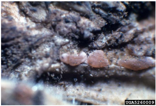
Figure 7: Salmon-colored spore masses of Volutella buxi on boxwood stem