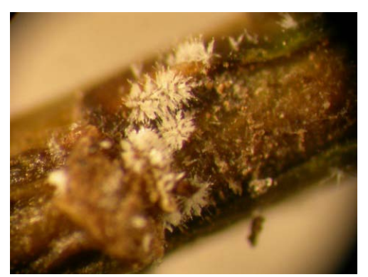
Figure 3: White stellate spore masses of C. buxicola on a boxwood stem.